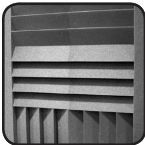
Sample Layout Suggestions